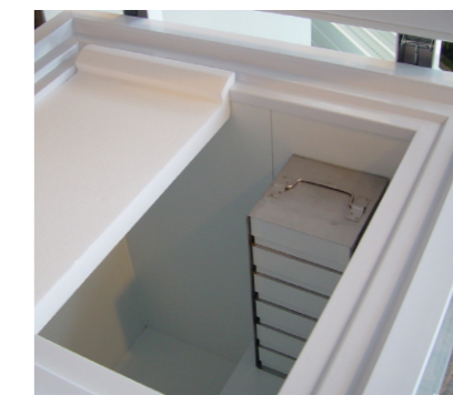
Inner lids (left hand side) which are mandatory for optimized function