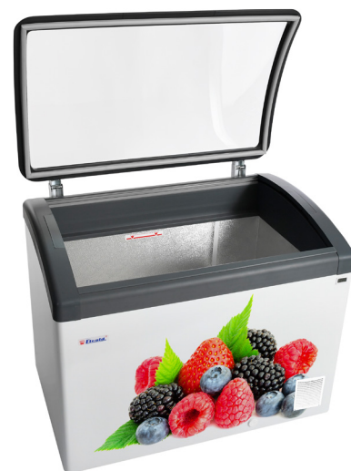
FOCUS 106 V WITH OPEN LID