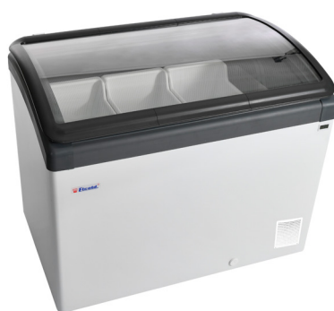
FOCUS 106 V WITH BULK CONTAINER

Cyclopentane is used as blowing agent and the cabinets are CFC free.