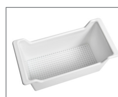
FOOD BUCKET (FDA-APPROVED FOR FOOD)