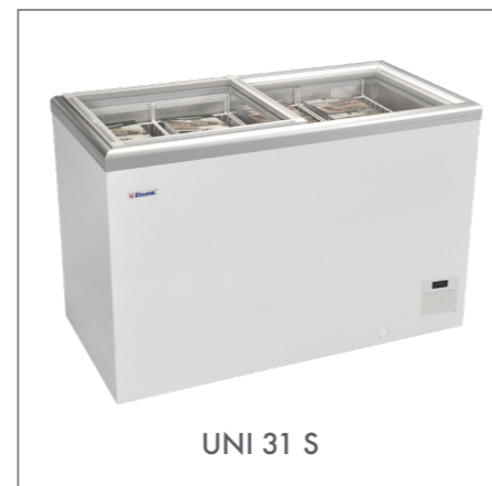
UNI 31 S