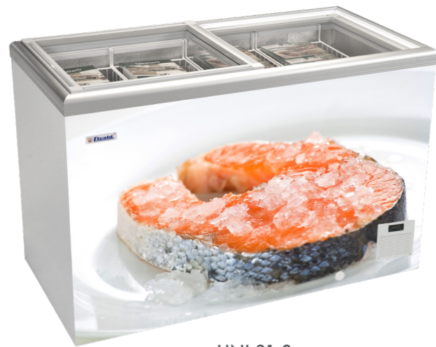
UNI 31 S