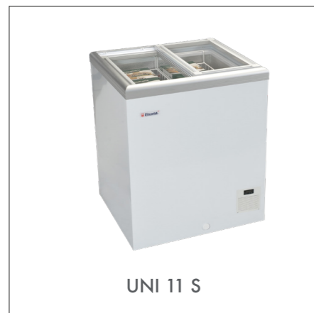
UNI 11 S