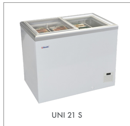
UNI 21 S